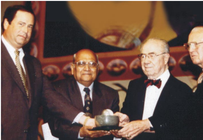
World Food Prize