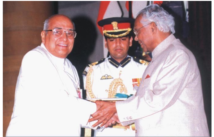
Padma Bhushan Award