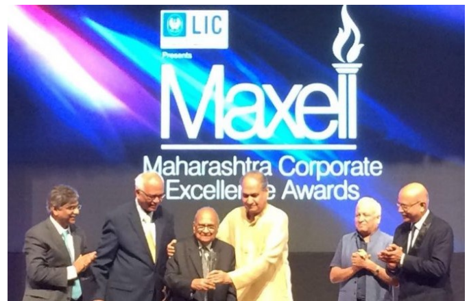
Maharashtra Corporate Excellence Award